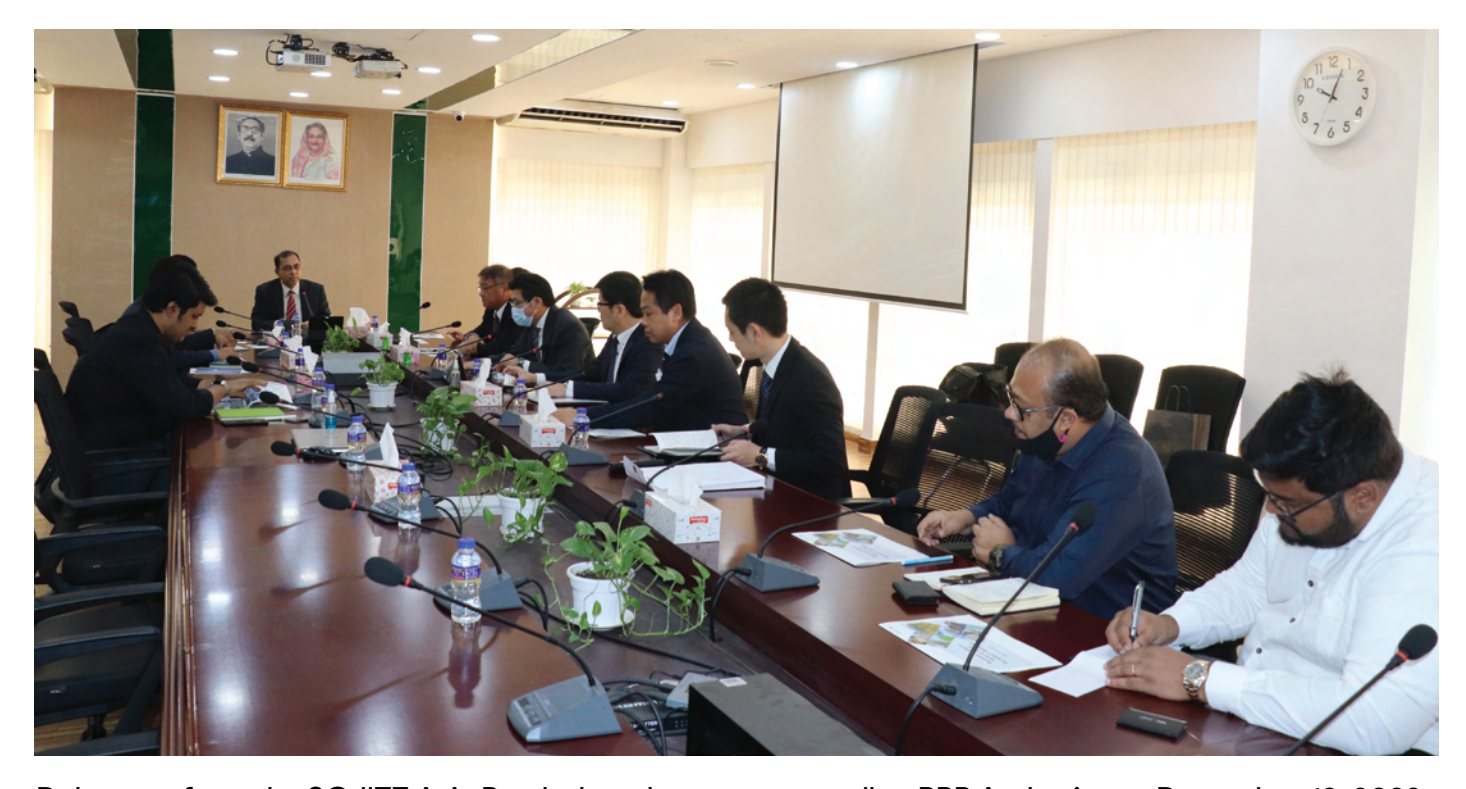
Delegates from the SOJITZ Asia Pte. Ltd made a courtesy call to PPP Authority on December 13, 2022.