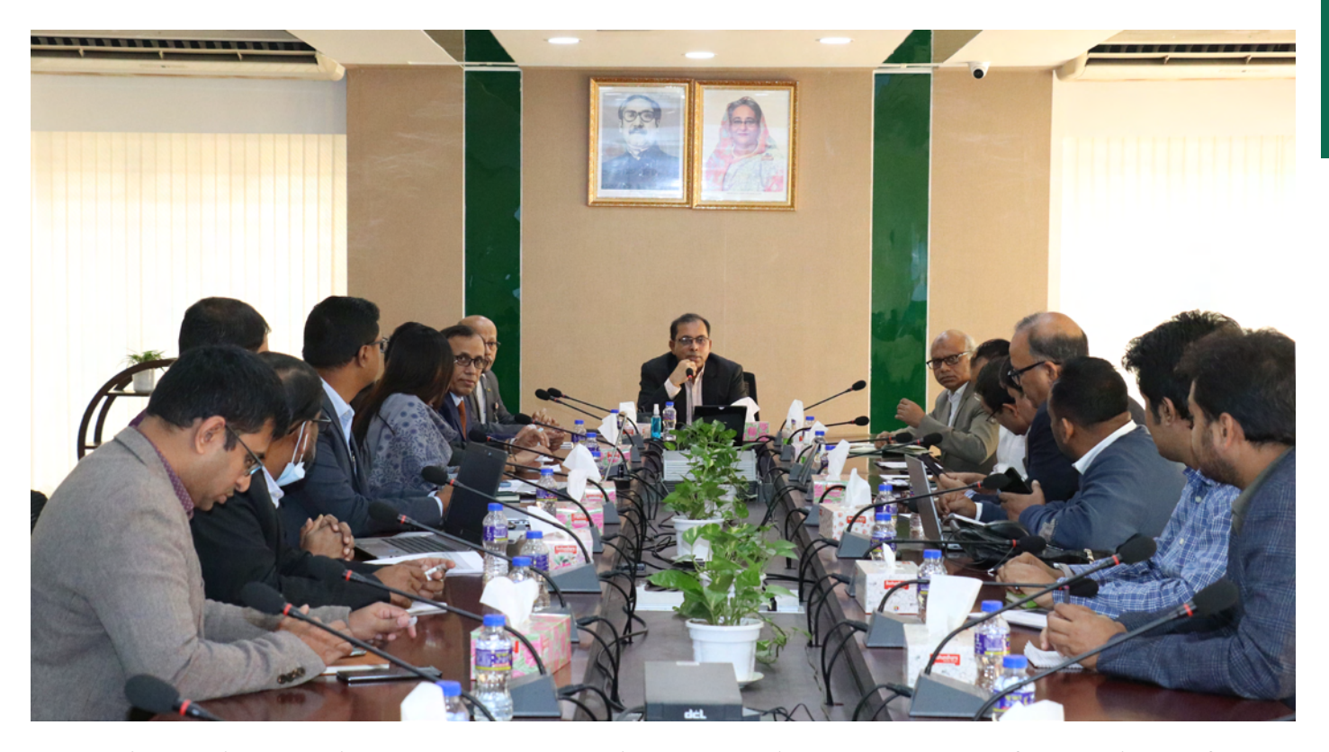
PPP Project review meeting held to assess the implementation and progress of the projects of Roads and Highway Department on December 21, 2022 at PPP Authority.