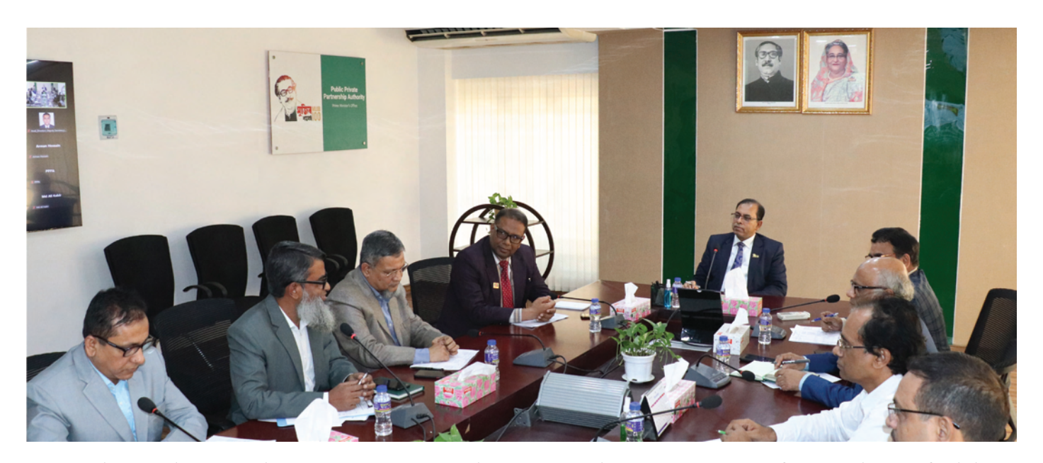
PPP Project review meeting held to assess the implementation and progress of the projects of Ministry of Railways on December 29,2022 at PPP Authority