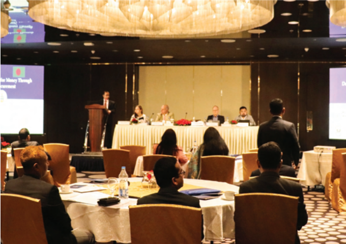
The US Department of Commercial Law Development Program (CLDP) under United States Department of Commerce organized two daylong training programs on PPP Procurement Strategy & Value For Money in association with the PPP Authority, Prime Ministers Office on December 11-12, 2022.