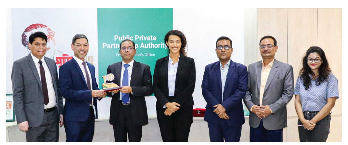
Delegates from the International Monetary Fund (IMF) made a courtesy call to PPP Authority on November 3, 2022